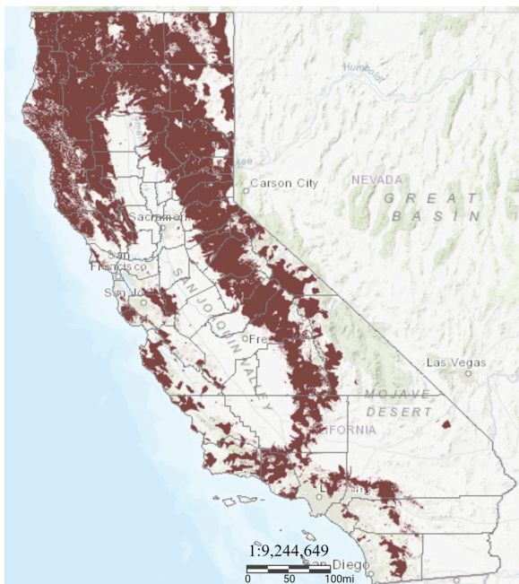
CAL FIRE, Tree Mortality Viewer, High Hazard Zones, 2022

GSNR directly addresses this critical need by creating a sustainable and economically viable use from this woody biomass.